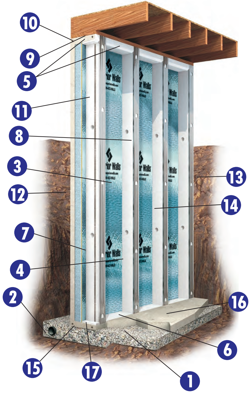
SPECIAL NOTE: Items #1, 2, & 16 as well as the joist/flooring system are provided on site per Superior Walls specifications by builder and contractors as an integral part of the Superior Walls foundation system.