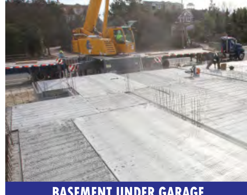
BASEMENT UNDER GARAGE