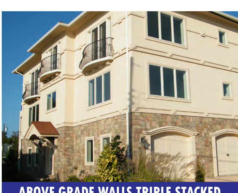
ABOVE GRADE WALLS TRIPLE STACKED