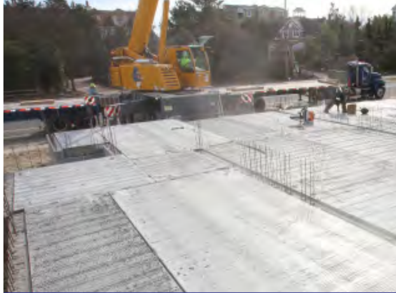
BASEMENT UNDER GARAGE