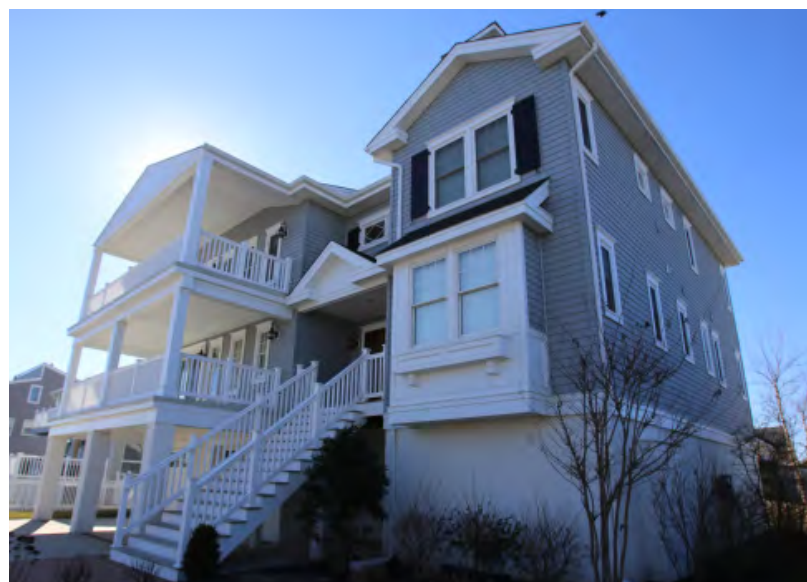
ABOVE GRADE WALLS FIRST LEVEL