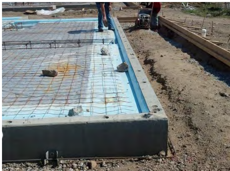
SLAB ON GRADE