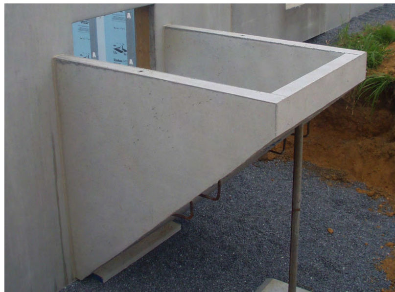
PRECAST STEP UNITS