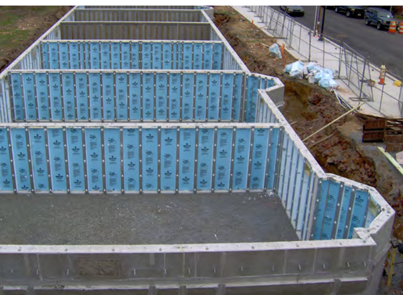
MULTI FAMILY RESIDENTIAL