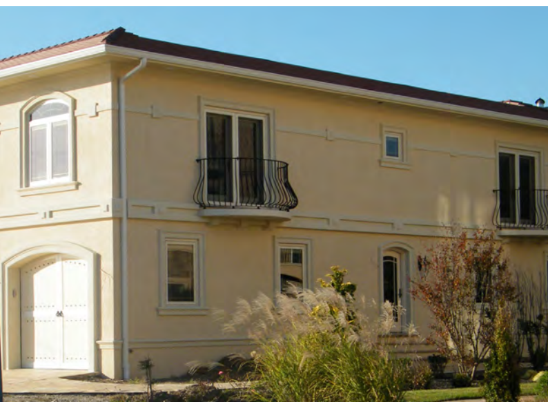
ABOVE GRADE WALLS DOUBLE STACKED